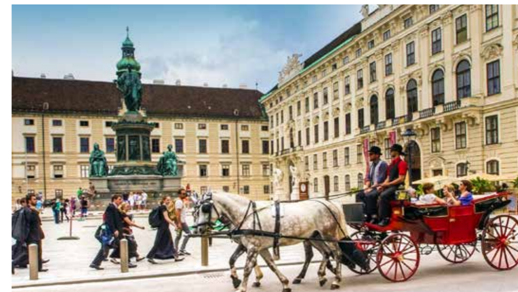
Hofburg Palace Vienna, Austria