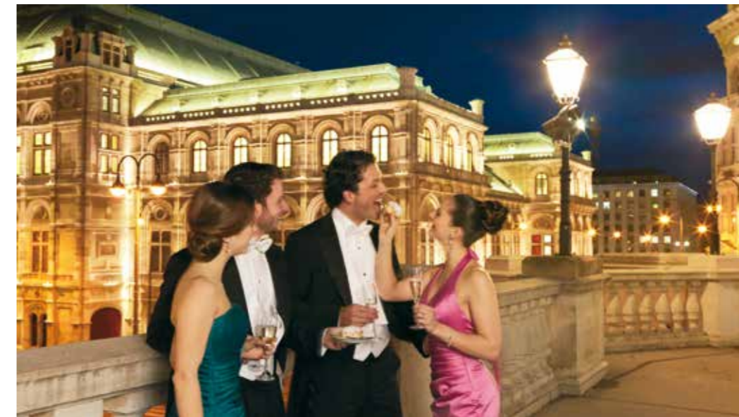
Vienna Opera / Austria

Enjoy a dinner and concert at Vienna Kursalon. Listen to the most beautiful operettas and piano concerts. Prices on request.